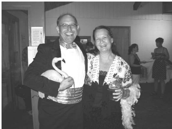
A good time was had by all at the InFormal Auction.

With less than a month to go, there is much to do, and many people are needed to provide support for the big day. It's essential that we have at least 200 volunteers to build the new play space-NO FORMAL CONSTRUCTION SKILLS REQUIRED-as well as others to supervise children, serve food to