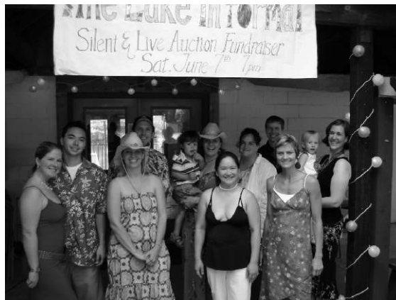
The new playground was conceived by a small group of parents and now the whole community is bringing it to life.