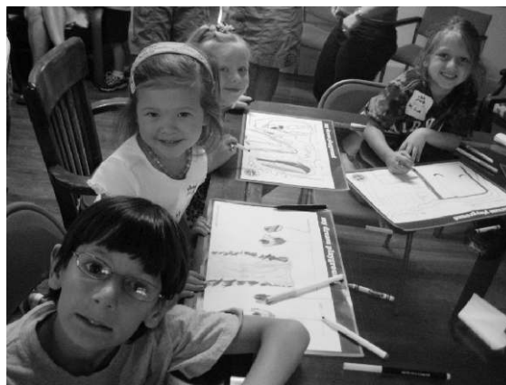
The children helped design their dream playground.

volunteers, coordinate logistics, manage registration, and more. Plans are to have a DJ, a very special guest, and some live music and other entertainment throughout the day! The build will take place from 8 am to mid-afternoon on August 23. (Lakeshore Dr. will be closed for the build between Magnolia and the tennis court that day. Concessions can be made for residents directly affected.)